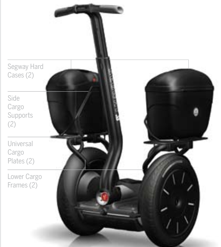
Segway Hard Cases (2)